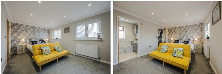
Bedroom one 10'7" x 16'4" (3.23 x 5.00)