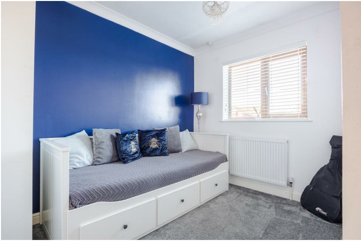
Bedroom five 6'6" x 8'0" (1.99 x 2.45)